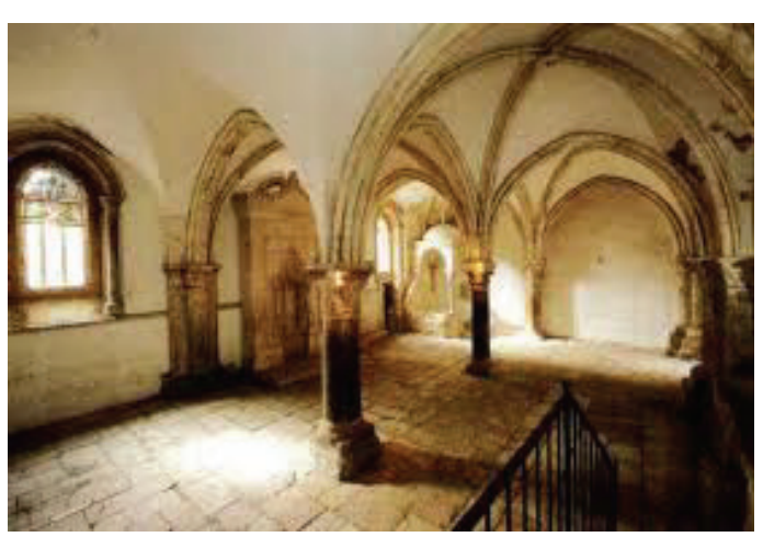
Church of the Cenacle, the Upper Room of the Last Supper

Brant Men of Song are hosting a Charity Concert on Saturday, February 23 at St. Andrew's United Church, 95 Darling Street, Brantford at 7:00 p.m. in support of the Heart and Stroke Foundation. Please join us. Free will offerings gratefully accepted.